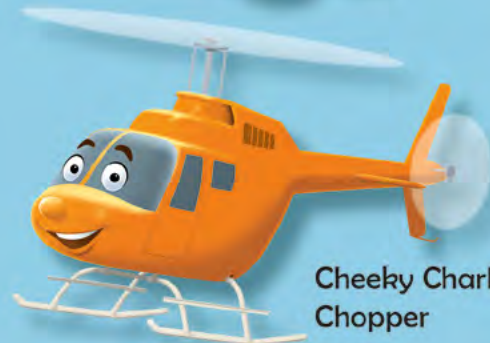
Cheeky Charlie Chopper