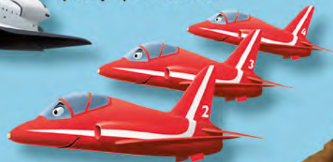
Benny & the Jets