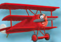
Baron Von Triplane