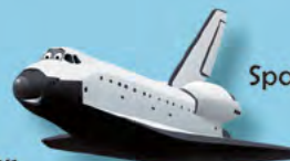
Sparky Space Shuttle